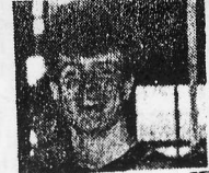
Look at BSH-ORION smiling like a shark !